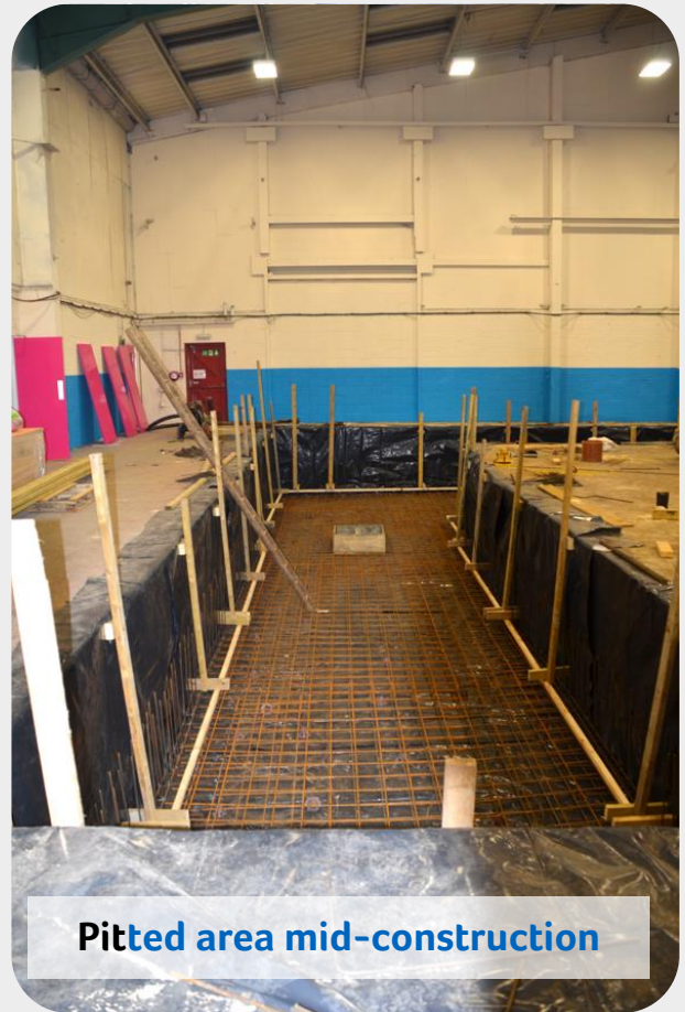
Pitted area mid-construction