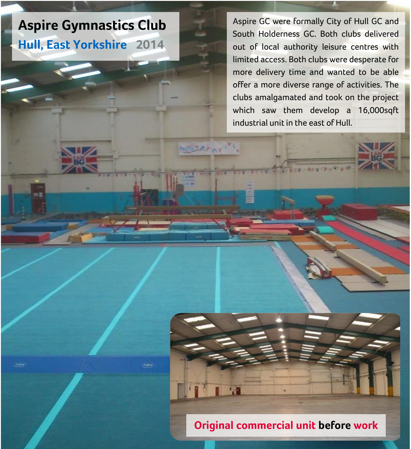
Original commercial unit before work

Aspire GC were formally City of Hull GC and South Holderness GC. Both clubs delivered out of local authority leisure centres with limited access. Both clubs were desperate for more delivery time and wanted to be able offer a more diverse range of activities. The clubs amalgamated and took on the project which saw them develop a 16,000sqft industrial unit in the east of Hull.