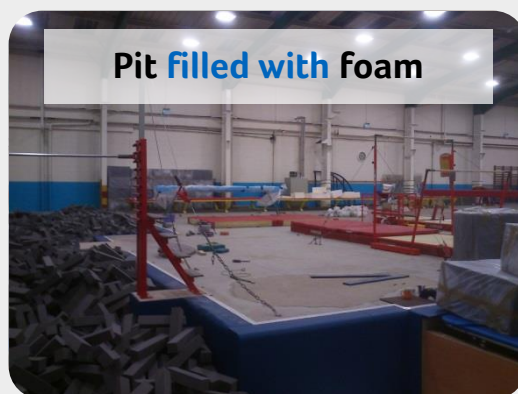
Pit filled with foam