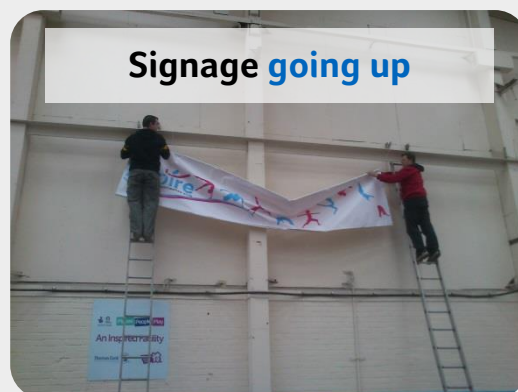
Signage going up