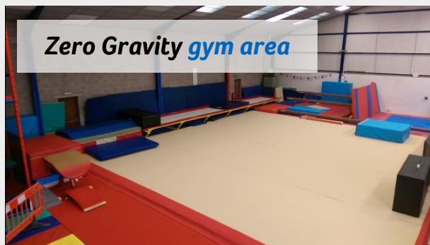
Zero Gravity gym area

All works on the entrance and lobby of Zero Gravity were fronted by the building's landlord. An agreement was subsequently arranged to have costs subsequently put on the lease (monthly rental costs).