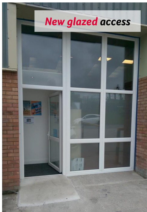
New glazed access

Zero Gravity Academy are a club of approximately 300 members with a Gymnastics for All ethos. The club had a variety of satellites with over three venues that they regularly run sessions from. The club also have very close links with local schools and community organisations allowing a large volume of additional bookings to keep their centre busy.