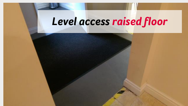
Level access raised floor